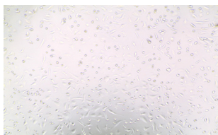
Figure 3. Viability of PathHunter eXpress cells were confirmed by bright field microscopy.